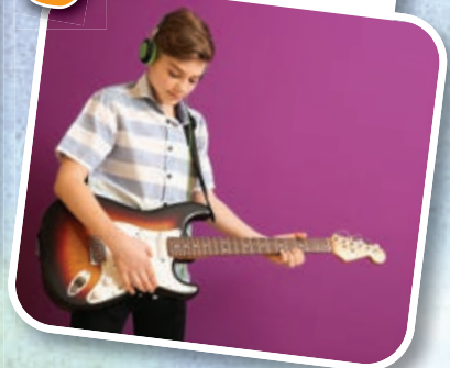
playing the guitar