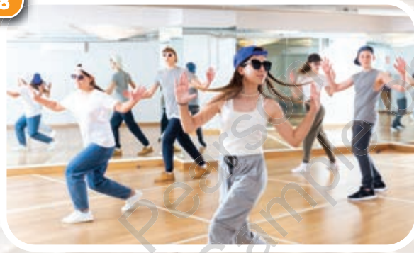
Taking up a new hobby is an easy way to make new friends .