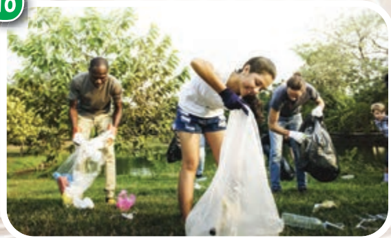
Doing volunteer work in my free time enriches my life .